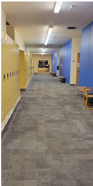
Left: The C wing hallway was empty and quiet during 6th period Thursday. Right: The B wing hallway was also calm.